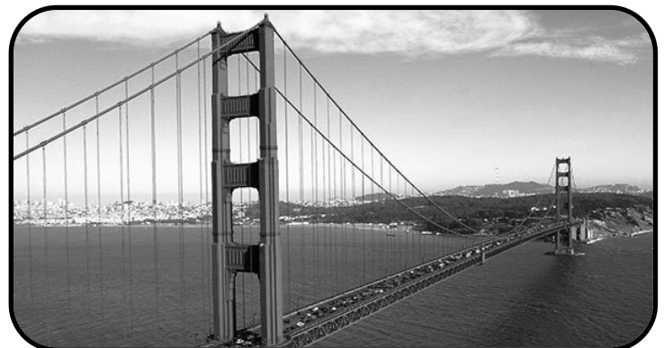
CALIFORNIA OCTOBER 20-29