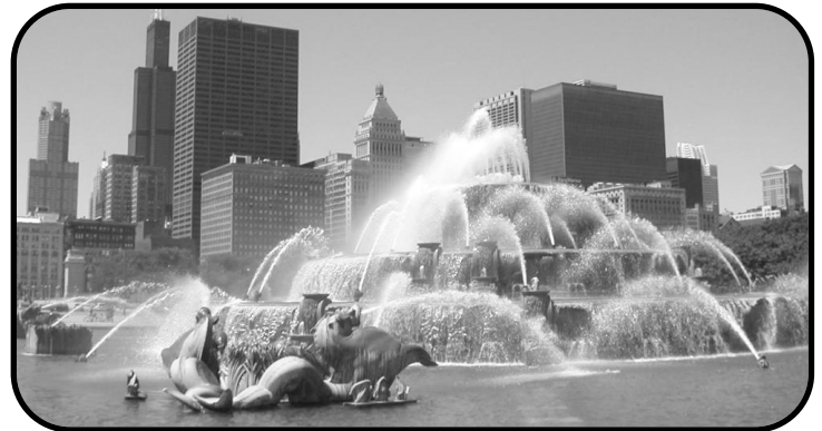
CHICAGO AUGUST 22-25