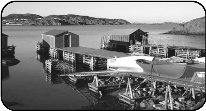
NEWFOUNDLAND JULY 3-11