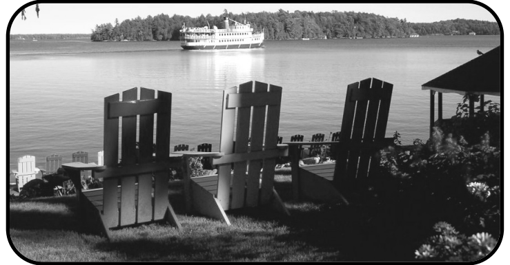
ONTARIO GET-AWAYS JUNE 19-20 AND SEPT. 30 - OCT. 2