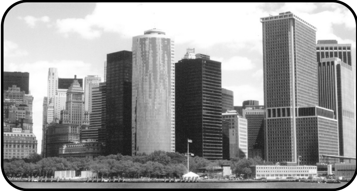
NEW YORK CITY MAY 17-20 AND DECEMBER 6-9