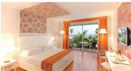
Hotel Caparena (Beach Front) or equivalent