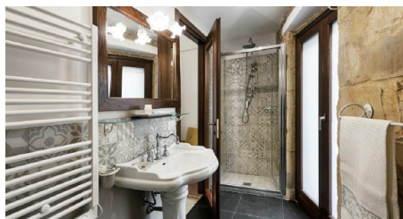
Itria Palace Hotel (Boutique) or equivalent