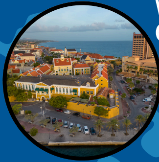
Willemstad, Curacao Day 6