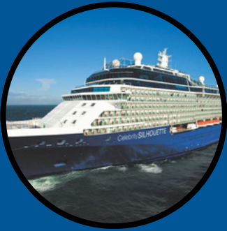
At sea Day 2