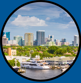
Fort Lauderdale, Florida Day 1 and 9