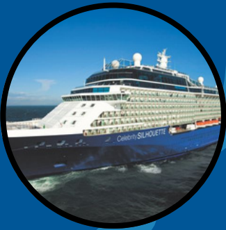
At sea Day 3