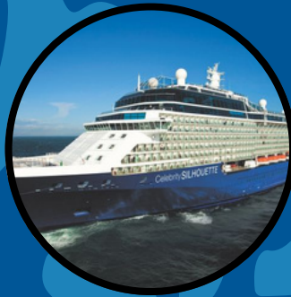
At sea Day 7