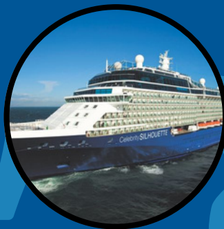
At sea Day 8