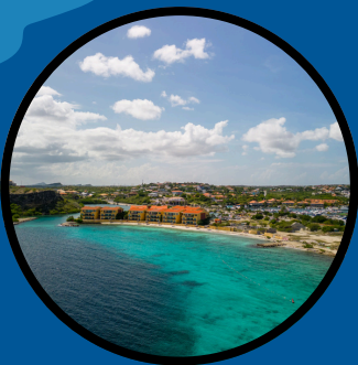
Kralendijk, Bonaire Day 4