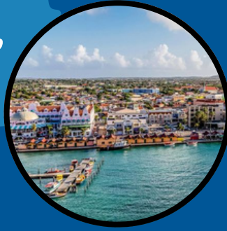
Oranjestad, Aruba Day 5