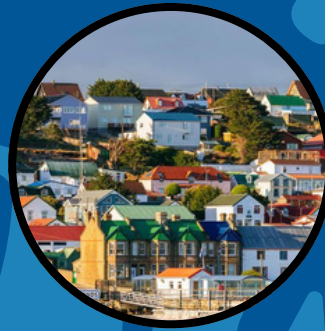
Port Stanley, Falkland Island Day 10