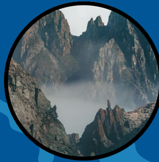
Elephant Island, Antarctica Day 8