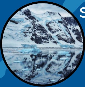
Schollart Channel, Antarctica Day 7