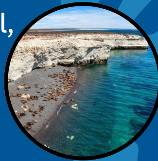
Puerto Madryn, Argentina Day 12