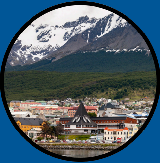
Ushuaia, Argentina Day 5