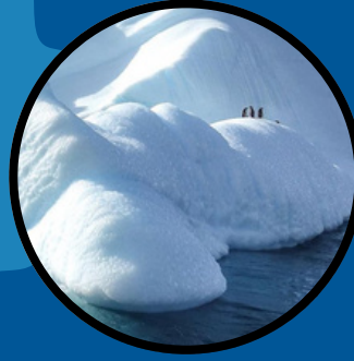
Gerlache Strait, Antarctica Day 7