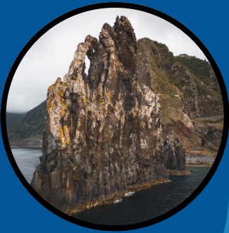
Caphe Horn, Chile Day 6