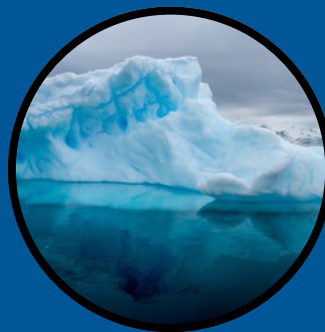
Paradise Bay, Antarctica Day 7