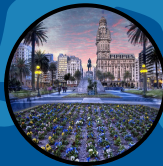
Montevideo, Uruguay Day 14