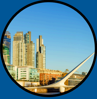
Buenos Aires, Argentina Day 1 et 15