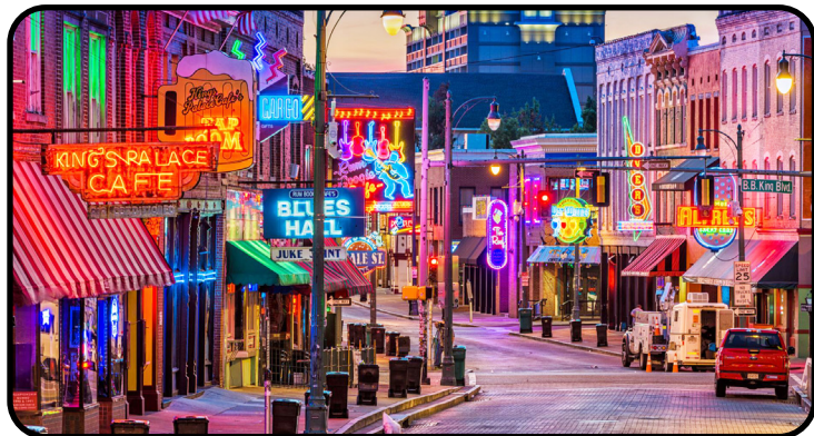
Louisville, Nashville & Memphis APRIL 21 - 28