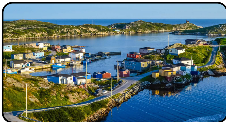
Newfoundland JULY 2 - 10