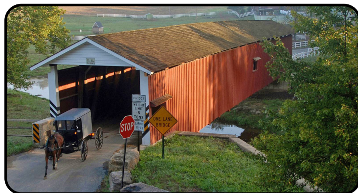
Lancaster, PA SEPTEMBER 10 - 12