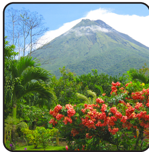
Photo Credits: Memphis, New York, Boldt Castle, Newfoundland, Lancaster, Pena National Palace (Sintra), Porto, Arenal Volcano (Costa Rica) - Google Images . Icebergs - Earl Clint.