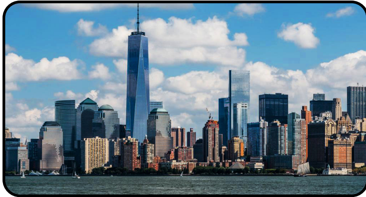
New York City MAY 29 - JUNE 1