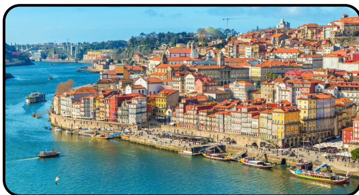
Portugal SEPTEMBER 24 - OCTOBER 6