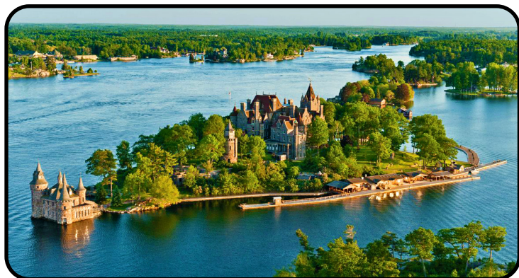
Eastern Ontario JUNE 9 - 11