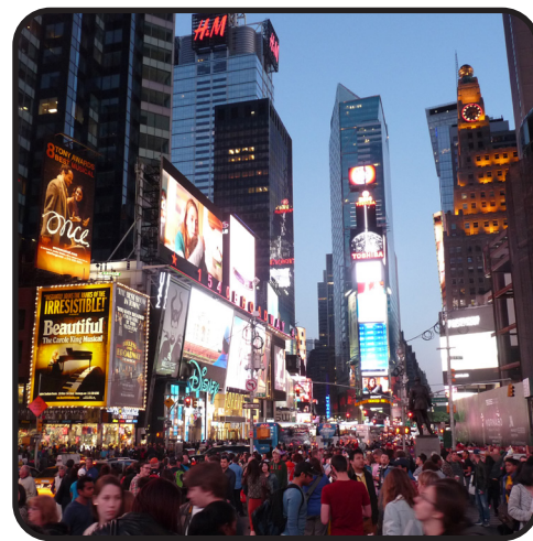
Photo Credits: Inside - Statue of Liberty, Puffins - Google Images. Front/Back - Nashville, Graceland, NL Outport, St. John's, Amish buggy, NYC skyline, fishing boats - Google Images. Icebergs, Times Square - Earl Clint.