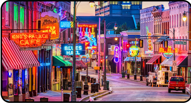
Louisville, Nashville & Memphis MAY 7 - 14