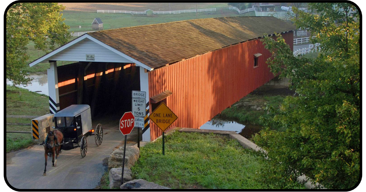
Lancaster, PA JUNE 3 - 5