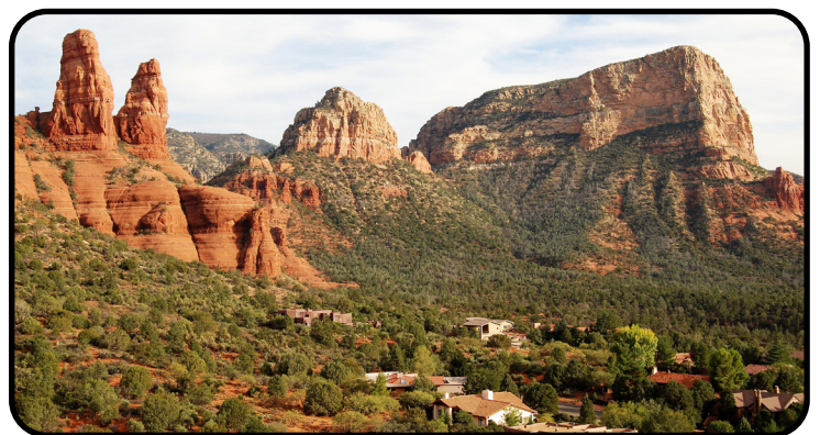
Utah & Arizona OCTOBER 16 - 24