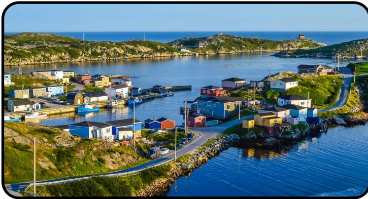
Newfoundland Highlights JULY 4 - 12