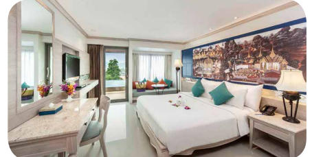
Novotel Phuket Resort Hotel (Superior Room) 4* or similar

Upgrade to 5 Star Phuket Hotel from $199 Extend your Phuket Stay from $180/person/night