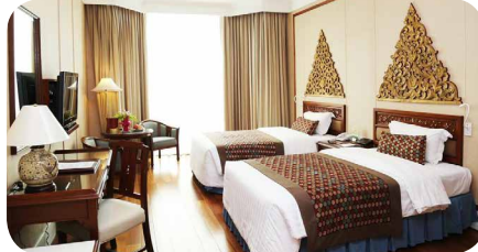
The Empress Chiang Mai Hotel (Superior Room) 4* or similar