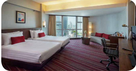
Ambassador Hotel Bangkok (Deluxe Room) 4* or similar