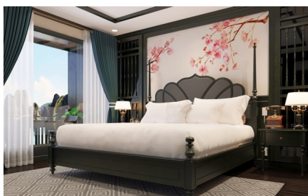
La Regina Grand Cruise Cabin

Lan Ha Bay, we have lunch in Ha Long Restaurant on board while passing Chan Voi (Elephant Feet) and the Tra Bau area. This afternoon, activity options include a bamboo boat excursion, or kayaking to discover the pristine and tranquil beauty of the Dark and Light Cave After sunset cocktails we will have a candlelight BBQ dinner on the sundeck.