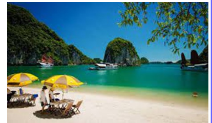
Ba Trai Dao beach