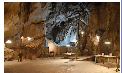
Hospital Cave - Cat Ba Island