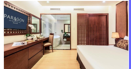
Paragon Hotel - HCMC