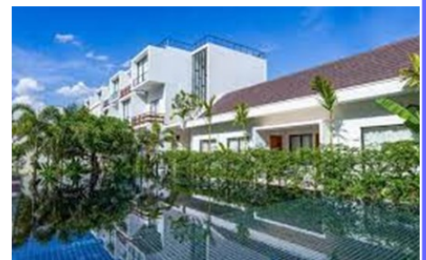
Lynnaya Bungalows - Siem Reap

Overnight Lynnaya Bungalows - Siem Reap. Meals - B (Lunch and dinner not included)