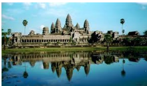
Angkor Wat - World Heritage Site

This morning we visit the temple of Preah Khan, or "The sacred Sword", Neak Pean Temple ("intertwined snakes"), a small but charming temple that was built in the middle of an artificial lagoon and which was believed