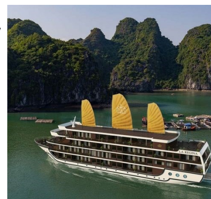
La Regina Grand Cruise Ship

The itinerary below could change depending on weather conditions. This morning our 3 hour bus journey takes us through scenic countryside of Red River Delta featuring rice fields and peaceful villages. On arrival in Ha Long Bay we transfer by speed boat to La Regina Grand Cruise Ship. Our ship boasts a total of 27 spacious suite cabins with floor-to-ceiling windows and private balconies that offer spectacular panorama views of Lan Ha Bay. After our welcome drink the Cruise Manager gives us a cruise orientation briefing covering activities and on board safety. While cruising to