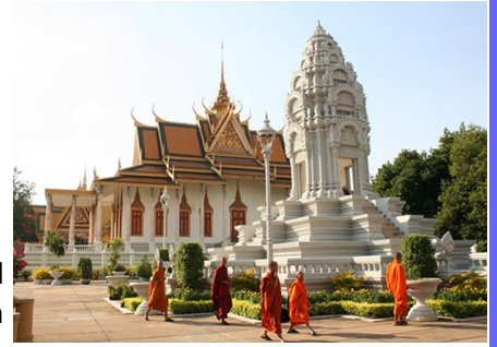
Royal Palace & Silver Pagoda Phnom Penh