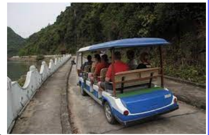
Transfer by bike or electric cart Viet Hai Village

Our tour ends after some morning free time and transfer to the airport for our departure flight. Meals - B