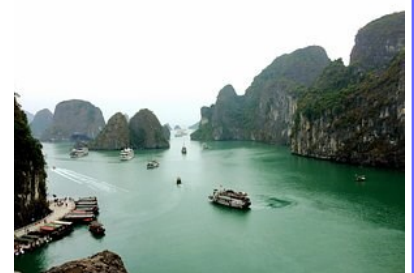
Karch landscape near Halong Bay

Tourist Visa for Vietnam and Cambodia - Assistance through our Vietnam Tour Operator is available to obtain group or individual visas for Vietnam and Cambodia. Visas will be arranged closer to departure. Cost is extra.