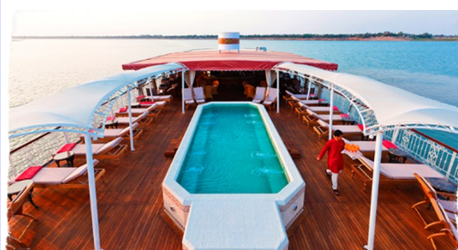
The Jahan Heritage Cruise