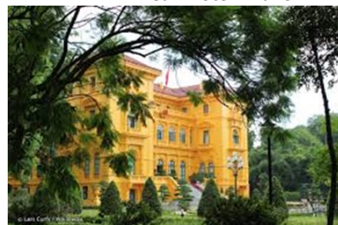
Hanoi Presidential Palace

A city tour will take you to Ba Dinh Square, where President Ho declared Vietnam's Independence from France, to see the outside of the Ho Chi Minh Mausoleum. We will also visit the Presidential palace, Ho Chi Minh house on stilts and Chua Mot Cot - the One-Pillar pagoda. Lunch will be at local restaurant. This afternoon, we visit Van Mieu - Hanoi's oldest school, built in 1070. Then we visit Hoa Lo - formerly a prison built by the French and then used for detaining US airmen captured by the Vietnamese. We will take a trishaw tour around bustling Old quarter before enjoying a water puppet show.