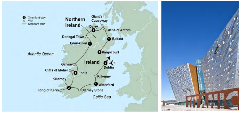
13 Days ● 17 Meals: 11 Breakfasts, 6 Dinners