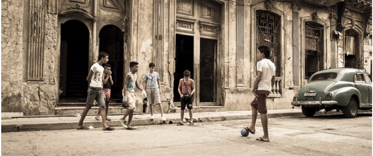
Streets of Havana

Please Note: Extensive walking, sometimes on uneven ground. Participants must be in reasonable physical condition and be able to climb stairs.