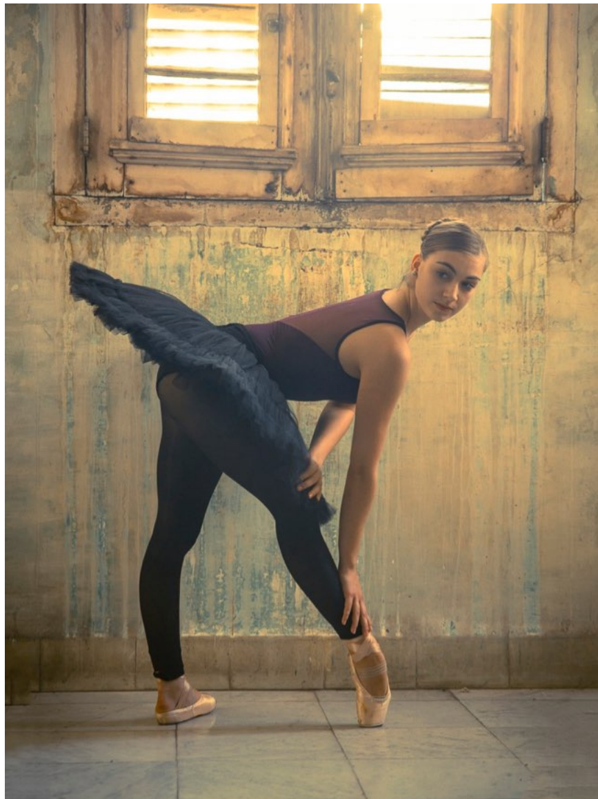
Private home with Ballet dancer.