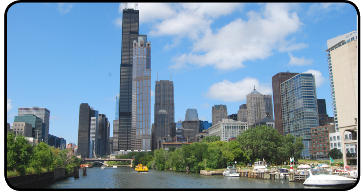
CHICAGO & MILWAUKEE AUGUST 24-28