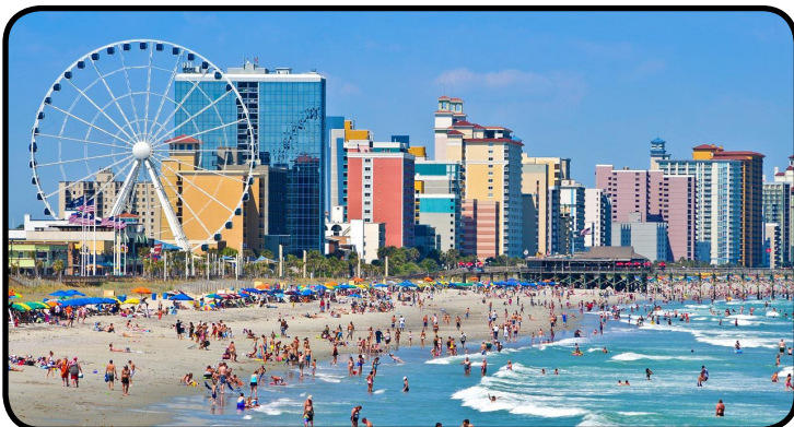
MYRTLE BEACH OCTOBER 20-27