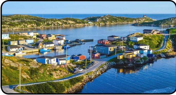
NEWFOUNDLAND JULY 5-13