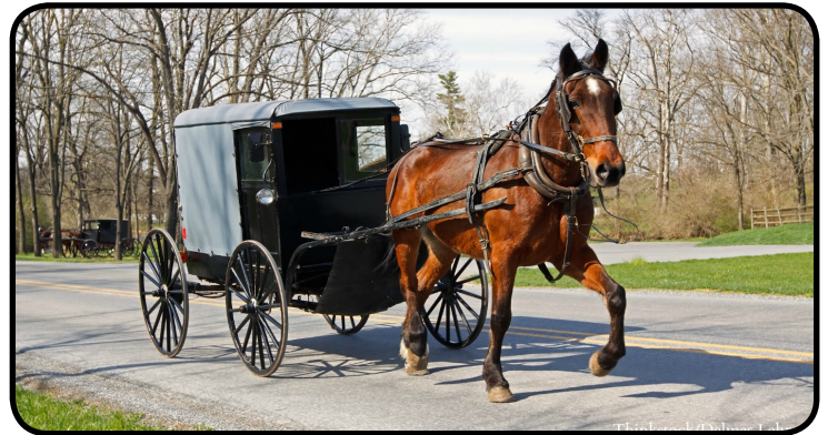
LANCASTER, PA SEPTEMBER 25-27