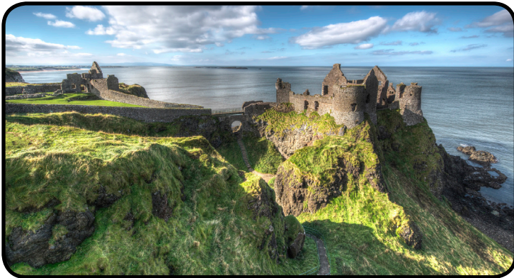
IRELAND SEPTEMBER 9-19