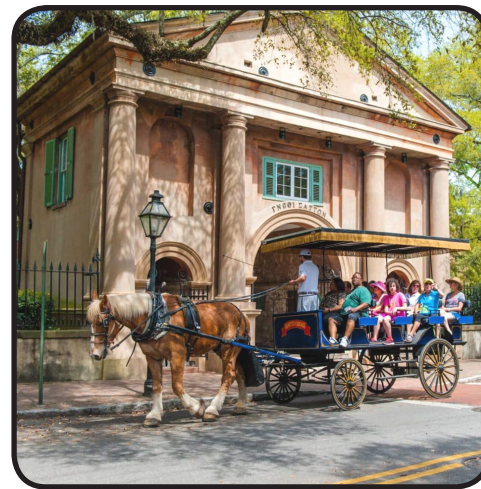
Photo Credits: Newfoundland, Chicago, Irish Coastline, Cork Cathedral, Amish Buggy, Myrtle Beach and Charleston Carriage – Google Images. Radio City Music Hall, Icebergs – Earl Clint