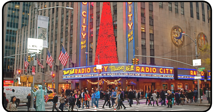
NEW YORK CITY DECEMBER 1-4

ALSO: SOUTHWESTERN ONTARIO MYSTERY TOUR - JUNE 26-27 TOUR COORDINATOR: EARL CLINT