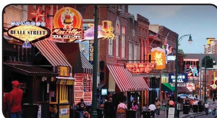
NASHVILLE, LOUISVILLE & MEMPHIS OCTOBER 23-28