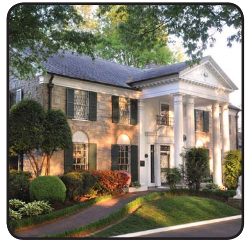
Photo Credits: Amish Buggy, Peggy's Cove, Newfoundland, New York City, Beale Street, Fenway Park, Graceland: Google Images, Muskoka: Lady Muskoka Cruises, Iceberg: Earl Clint