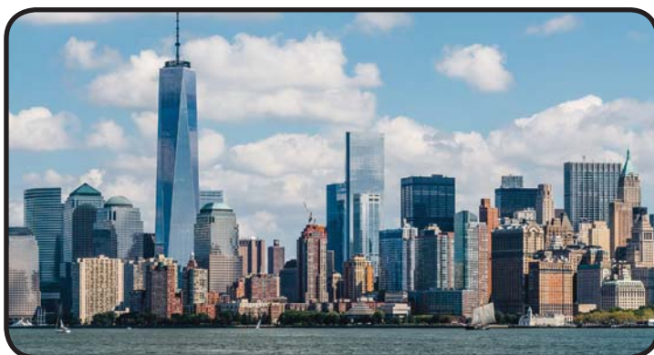
BOSTON & NEW YORK CITY SEPTEMBER 18-22