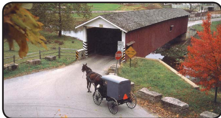
LANCASTER MAY 11-13