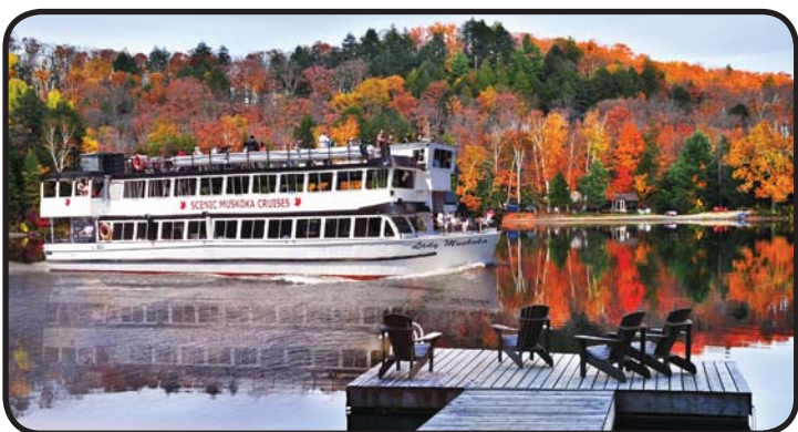
MUSKOKA & OTTAWA FALL COLOUR OCTOBER 2-5