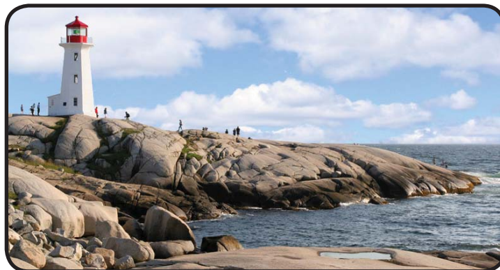
NOVA SCOTIA TATTOO & P.E.I. JUNE 28 - JULY 2